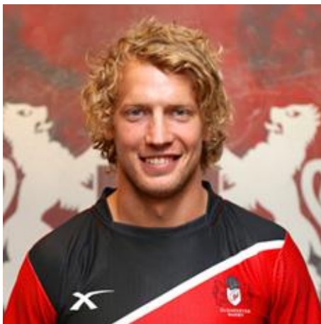
Photo of Billy Twelvetrees. Gloucester Rugby Club & England (22 Caps).

The official start of the season and opening of our new Junior and Mini pitches, Leaffield Road will be Sunday 25 September. Billy Twelvetrees will officially open the pitches and the 25 September will also be the 'official' sign on day for mini and junior membership. This will be a community family day with a series of events, refreshments and fun for all ages. We will need volunteers to help support this event, such as supporting membership sign up, helping with refreshments, helping to coordinate events etc Willing volunteers please contact rugby@fairfordrfc.co.uk